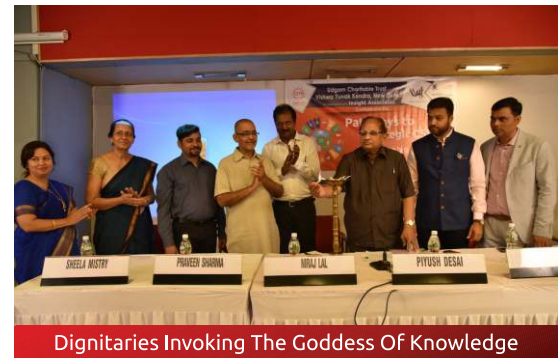
Dignitaries Invoking The Goddess Of Knowledge